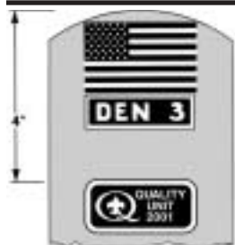
CUB SCOUT OR WEBELOS SCOUT RIGHT SLEEVE